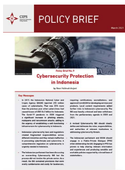
Cybersecurity Protection in Indonesia