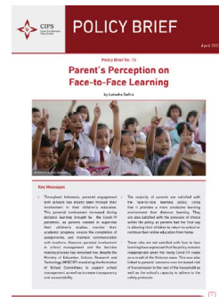
Parent's Perception on Face-to-Face Learning