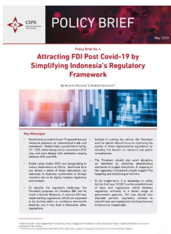
Attracting FDI Post Covid-19 by Simplifying Indonesia's Regulatory Framework