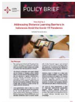
Addressing Distance Learning Barriers in Indonesia Amid the Covid-19 Pandemic