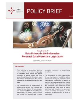
Data Privacy in the Indonesian Personal Data Protection Legislation