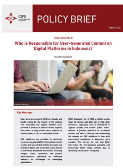
Who is Responsible for User-Generated Content on Digital Platforms in Indonesia?