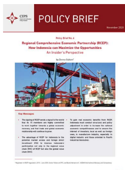
Regional Comprehensive Economic Partnership (RCEP): How Indonesia can Maximize the Opportunities An Insider's Perspective