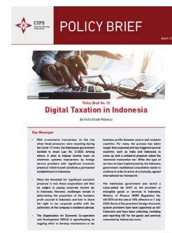
Digital Taxation in Indonesia

Go to our website to access more titles: www.cips-indonesia.org/publications